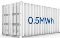
Standard 20ft containers