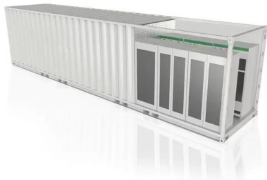
Photo Voltaic Systems

Barbados Sustainable Energy Conference and Expo 2021 Frequently Asked Questions Energy output of solar PV systems. Each solar PV panel is rated on its peak electrical output. For example, a panel with a 75 watts (W) peak rating (75 Wp) will have an output of 75 W under test conditions. Solar PV panels are suitable in both rural and